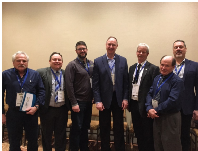
Left to Right: Councillor MacKay, CAO Tremblay, Councillor Nicholson, MPP John Yakabuski (Minister of Natural Resources & Forestry), Mayor Moore, Councillor McLaughlin, Councillor Olmstead)