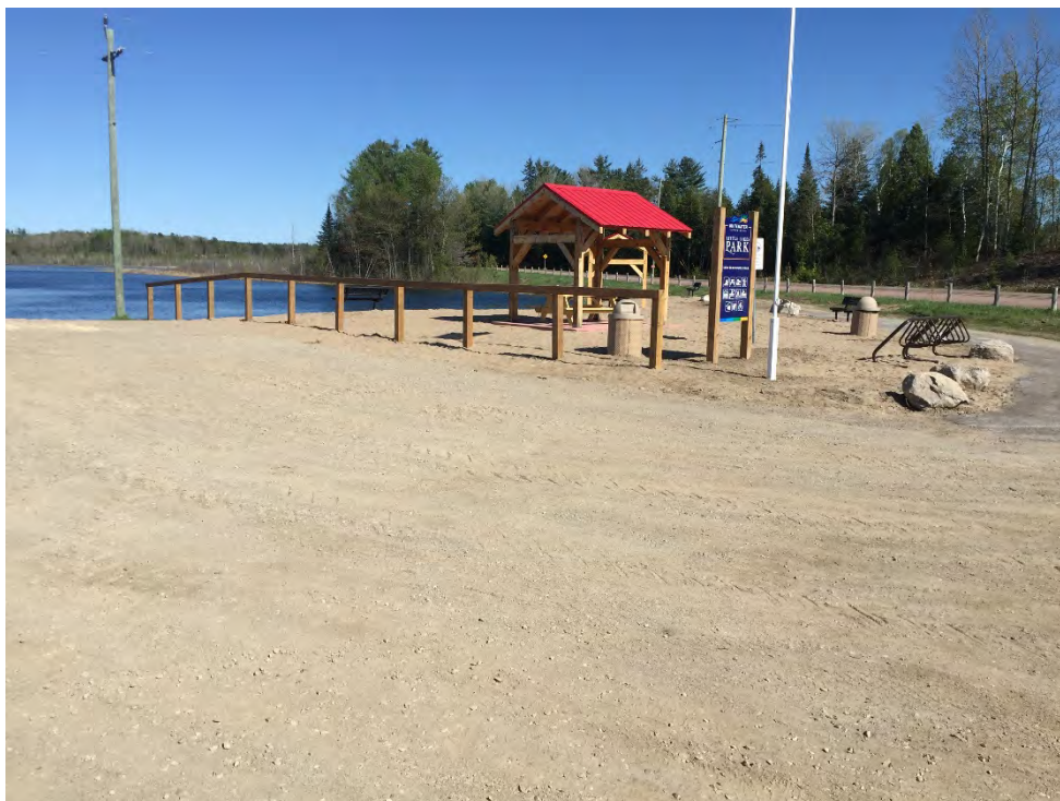
Figure 5-Little Lakes