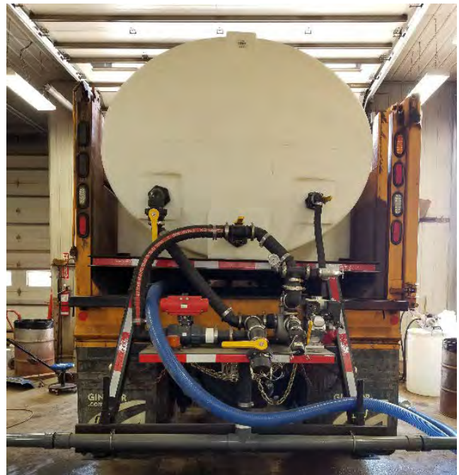
Figure 7-New Slip-in Water Tank