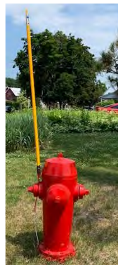
Figure 2-Painted Fire Hydrant