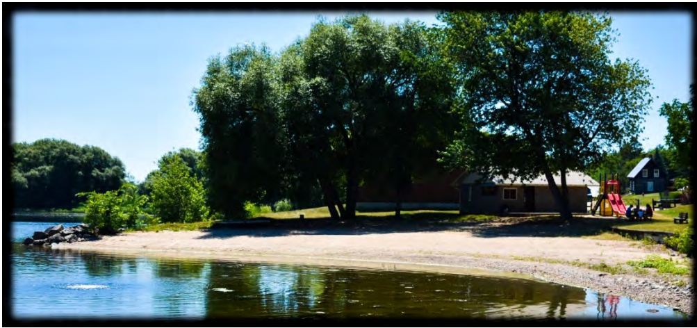
Figure 4-Cobden Beach