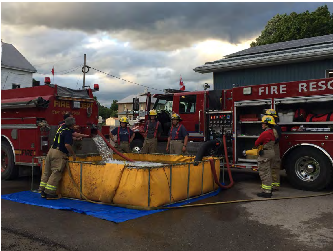
Figure 6-Station 4 Training