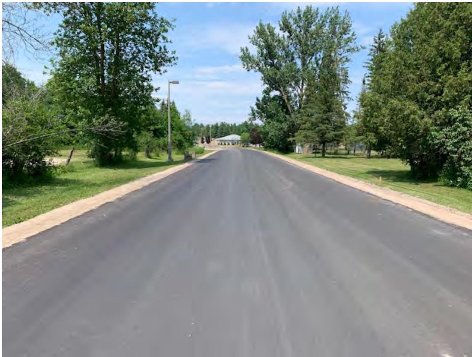
Figure 8-Newly Paved Morrison Drive