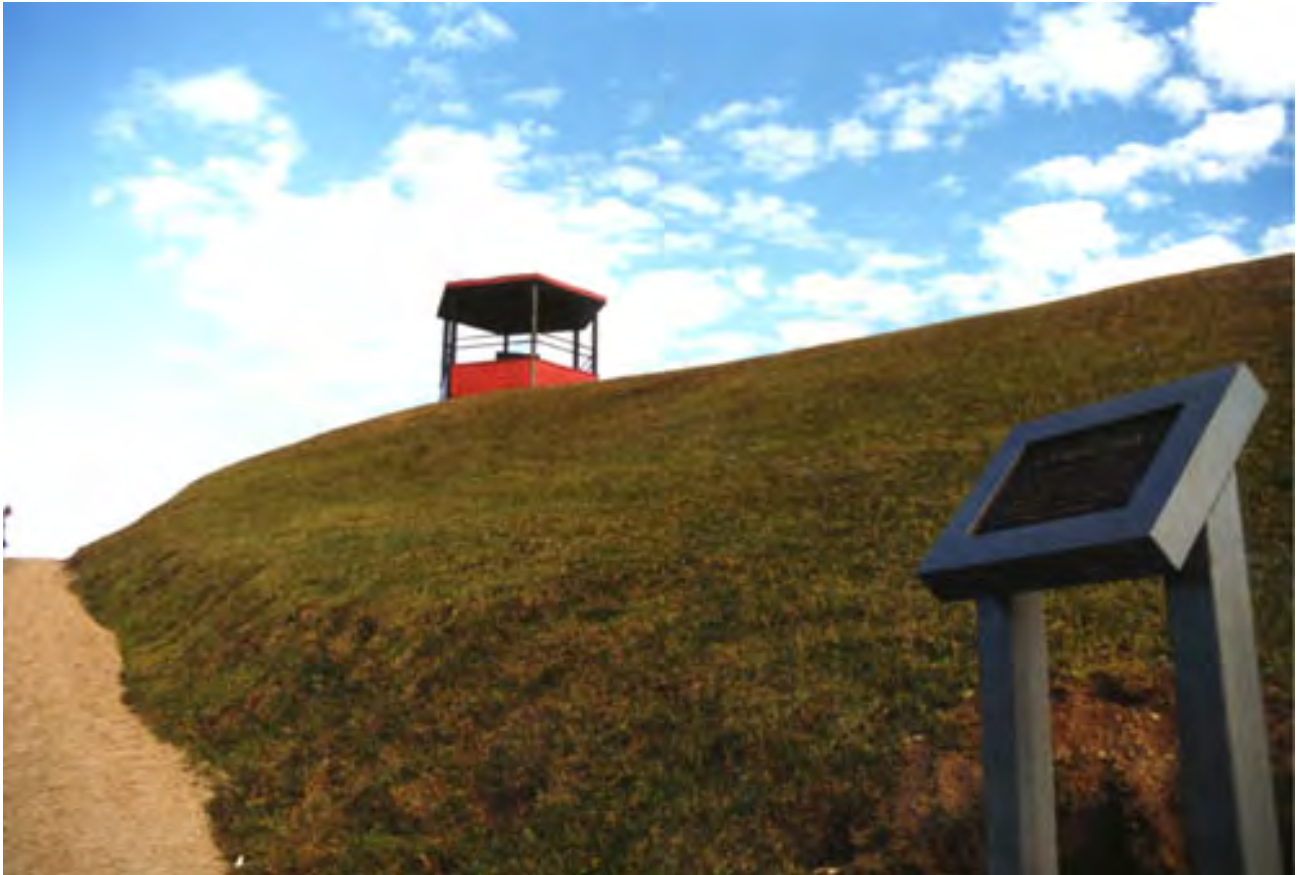
Figure 1-Westmeath Lookout