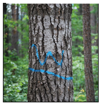
Figure 2. Trees are marked blue for wildlife value.

Find out more about sustainable forest management on Renfrew County Forests here: https://www.countyofrenfrew.on.ca/en/living-here/forests.aspx