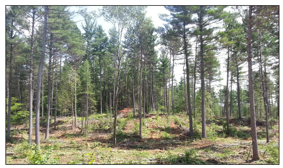
Figure 3. Example of a Seeding Cut, after mechanical site preparation.

Area A with receive a "Preparatory Cut", with the goal of giving the best overstory trees – white and red pine, in this case - more room to grow big, healthy crowns to "prepare" to be seed producers at the next stage of harvest, the "Seeding Cut". No regeneration treatments will occur in this area until after the next stage of harvest. Eventually, once the pine understory has been successfully established and is well on its way to success (>6m tall), most of the overstory will be removed to make room for the next generation. Veterans will be retained, but as we have seen with recent mortality and blowdown – trees don't live forever.