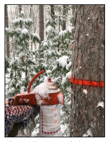
Figure 1. Trees are marked orange for harvest

Please direct any questions to County Forester, Lacey Rose, at Irose@countyofrenfrew.on.ca.